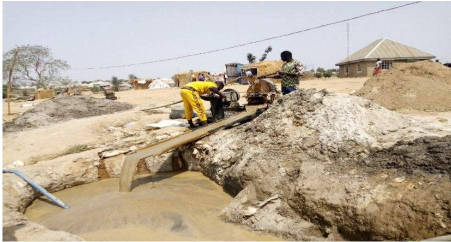
Figure 5: Primary processing of gold at Uke mining site, Nasarawa state