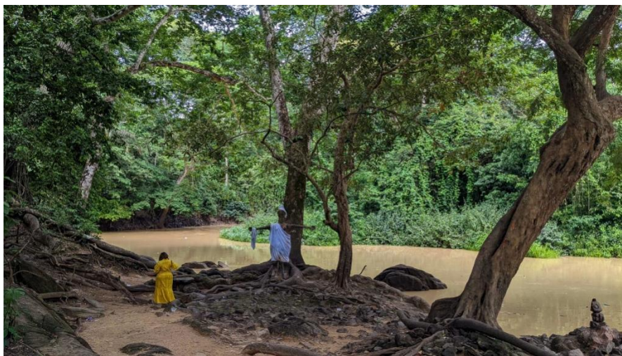
Figure 1. Polluted section of the Osun river from artisanal gold mining activities, Osogbo

Water is essential to life on our planet. A prerequisite of sustainable development must be to ensure uncontaminated streams, rivers, lakes and oceans. The mining and processing of mined materials generally require water. Water is also the primary vehicle by which mining-related contaminants can inadvertently be transported into the environment and worsen the quality of water resources. Mining water pollution has severe consequences for wildlife and human life. Protecting endangered species and maintaining clean water sources are crucial for sustaining biodiversity, ensuring human health and well-being. Prevention of water quality degradation is an important step in ensuring environmental sustainability in mining areas.