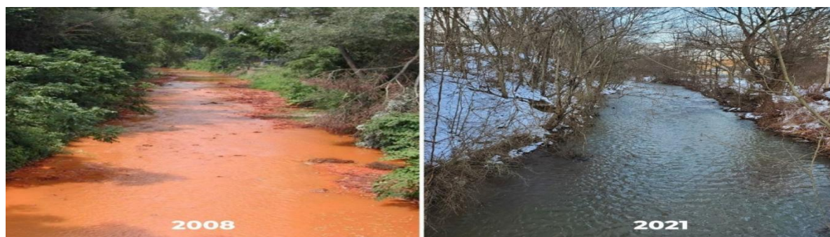
Figure 3. Left: River pollution by acid mine drainage. Right: Polluted river after cleaning