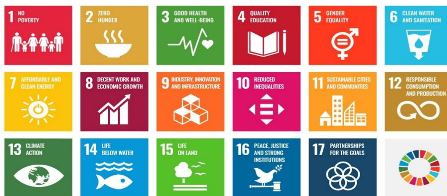
Figure 7. Sustainable Development Goals (SDG, 2015)