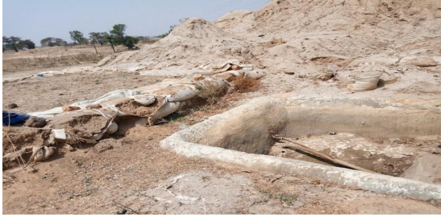
Figure 4: Reprocessing of gold using cyanide at Uke gold mining site

An analysis of water quality in Onyema and Okpala mine districts in Enugu, Southeast, Nigeria was reported by mean values of heavy metals namely; Cadmium, Arsenic, Lead, Chromium were respectively reported as 0.33mg/l, 0.06 mg/l, 0.53mg/l and 0.06 mg/l with mean pH values of 5.4 all of which exceeded the WHO permissible limits of 0.0-5.0mg/l for all the metals identified.. It was also reported that total dissolved solids (TDS) values ranging between 21.80 and 520 mg/l were below WHO permissible limits of 0.00-1500 mg/l but however injurious to the aquatic life in the catchment (Ojonimi, 2020).