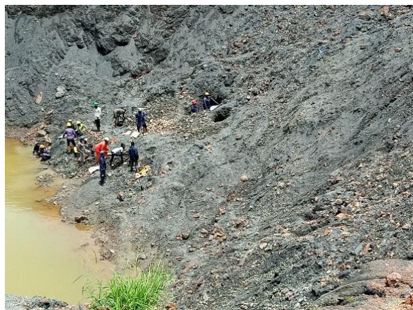
Figure 2. Polluted water bodies at mining sites, near Abakaliki, Ebonyi state.