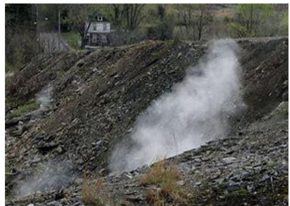
Figure 6. Fire-setting activities at Magnet quarry, Kaduna

Although fire-setting was frequently used before modern times, it has been used sporadically since then. The artisanal miners set fire on the rock mass to weaken its strength. Water is then sprayed on the rock to cool it. The effect of heating and cooling (expansion and contraction) leads to cracking of